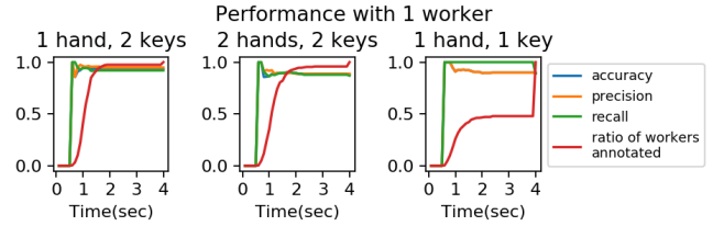
Figure 2. Performance of individual workers, according to time.

More than half of workers were capable of giving inputs within 1.06 seconds, regardless of the condition. There was a signifi-